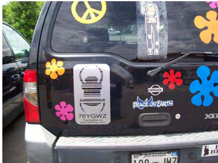
TB geo-car.